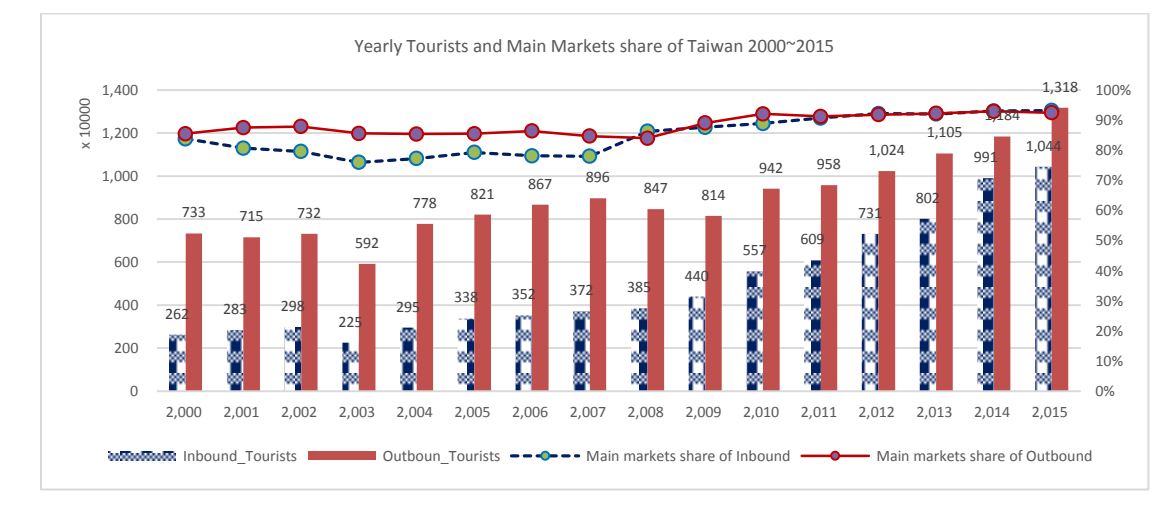
Fig. 3: The inbound-outbound tourists and aggregated weights

and ratio of in-out female tourists (RIOFT) as well to capture the gender composition and variation with respect to static and dynamic point of view. The inbound-outbound tourists and weights each year of top 10 markets from 2005 to 2015 are shown in Fig. 3, and the definitions of analyzed indicators are given in table 5. The months collected and analyzed each market are listed in table 6, and the yearly aggregated tourists of every market are illustrated in table 7.