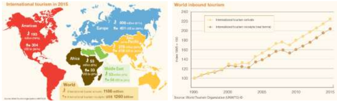
Fig. 1: International tourism overview in 2015.

Arrivals, receipts, and associated weights cross regions of international tourism in 2015 is shown in Fig. 1, and the amounts of international tourism arrivals and receipts for past 2 decades is offered in Fig. 2. The International tourist arrivals and tourism receipts 2016 are given in table 1 and 2.