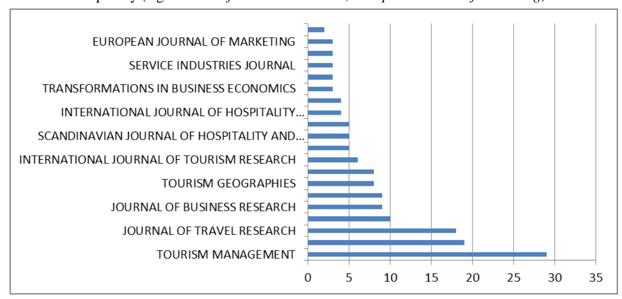
Fig. 2: Leading Outlets of Destination Branding Research

According to Figure 2, most studies on destination branding have so far been published in Tourism Management which is considered one of the two premier tourism journals alongside the Annals of Tourism Research (or the Top Tourism Trio which further includes the Journal of Travel Research ranked second on this list). Interestingly to note, the Annals (ATR) do however not appear in this list, which reflects the mission of its editorial board to position ATR as a broad social science journal, with lesser emphasis on traditional management-related research. It is further noteworthy that a considerable share of destination branding research has been published in journals that do not have a primary business and management focus (e.g. Tourism Geographies ), or in journals that have a broader marketing/management perspective, not focusing exclusively on tourism and/or hospitality (e.g. Journal of Business Research, European Journal of Marketing ).: