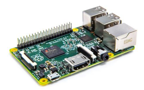
Fig. 2 Raspberry Pi – Single Board Computer

The original Raspberry Pi was based on Broadcom BCM2835 SoC (System on Chip), which packs an ARM11 700 MHz processor, VideoCore IV GPU, and originally had 256 MB RAM, later upgraded (models B and B+) to 512 MB. The system had Secure Digital (SD) (models A and B), but was upgraded to MicroSD from models B+, sockets for boot media and non volatile storage.