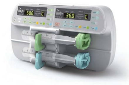
Fig. 1: A Commercially Available Infusion Pump

An infusion pump infuses fluids, drugs, medications or nutrients into a patient's blood stream. It is mostly used intravenously, but subcutaneous, arterial and epidural infusions are occasionally used.